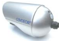
Embraced back cover design for water resistance